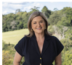
Athena Law 07 5442 1855

Price : $ 870,000 Land Size : 2023 sqm View : https://www.propertylane.com.au/sale/qld/sunshine-coast/eudlo/residential/house/7811948