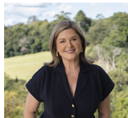
Athena Law 07 5442 1855

View : https://www.propertylane.com.au/sale/qld/sunshine-coast/eudlo/residential/house/7814103