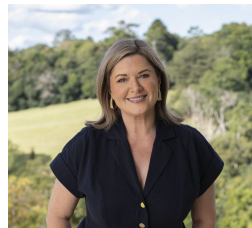
Athena Law 07 5442 1855

Building Size : 29 sqm Land Size : 620 sqm View : https://www.propertylane.com.au/sale/qld/sunshine-coast/kawana-island/residential/house/7814210