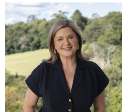
Athena Law 07 5442 1855

View : https://www.propertylane.com.au/sale/qld/sunshine-coast/woombye/residential/house/7814237