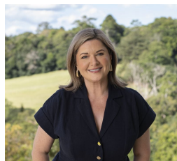
Athena Law 07 5442 1855

Type : House Building Size : 24 sqm Land Size : 861 sqm View : https://www.propertylane.com.au/sale/ql/sunshine-coast/coes-creek/residential/house/7814267