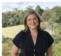
Athena Law 07 5442 1855

View : https://www.propertylane.com.au/sale/ql/sunshine-coast/marcoola/residential/unit/7814311