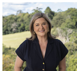
Athena Law 07 5442 1855

View : https://www.propertylane.com.au/sale/qld/sunshine-coast/montville/residential/land/7814336