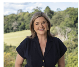
Athena Law 07 5442 1855