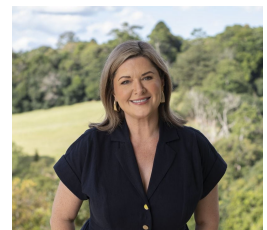
Athena Law 07 5442 1855