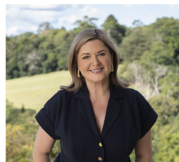
Athena Law 07 5442 1855