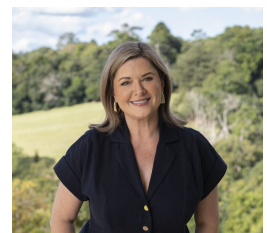
Athena Law 07 5442 1855