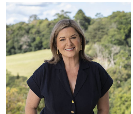
Athena Law 07 5449 1855