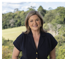
Athena Law 07 5412 1855

Type : House Price : Offers From $1.8m Building Size : 434 sqm Land Size : 4926 sqm View : https://www.propertylane.com.au/sale/ql/sunshine-coast/montville/residential/house/8134898