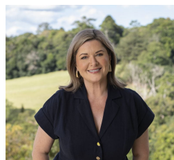
Athena Law 07 5419 1855

Type : House Price : Offers From $1.8m Building Size : 434 sqm Land Size : 4926 sqm View : https://www.propertylane.com.au/sale/ql/sunshine-coast/montville/residential/house/8134898