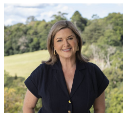
Athena Law 07 5442 1855

Type : House Price : Buyers in the Mid $700,000's Building Size : 307 sqm Land Size : 946 sqm View : https://www.propertylane.com.au/sale/ql/sunshine-coast/coes-creek/residential/house/8140082